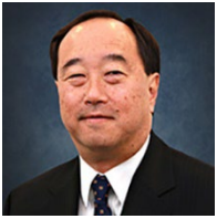
GORDON I. ITO (ee – toh) Commissioner